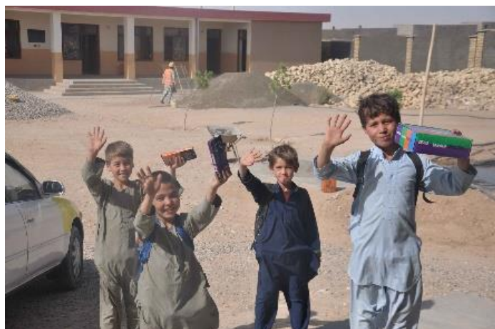
All children are happy about new writing materials

The living situation throughout the country has deteriorated even further. According to UN organisations, two thirds of the Afghan population are suffering from hunger. Late summer is traditionally a very labour-intensive time: crops have to be harvested and mud houses made ready for winter. In many families, children have to contribute to the livelihood by herding sheep and goats for other families, making mud bricks or working in agriculture. Girls work in carpet making. They receive a very low wage for this, but without their help it is even more difficult to survive. Many children no longer make it to school - even though they are so enthusiastic about learning and dream of becoming a doctor, teacher or pilot.