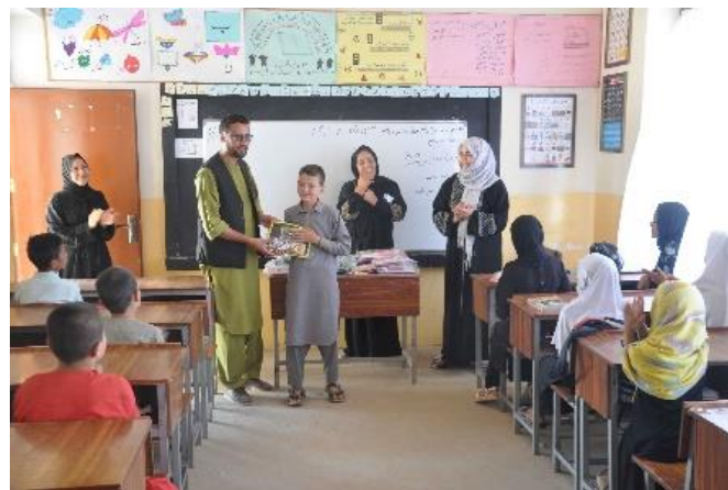
A competition between girls and boys. Many prizes are distributed

In our small Ferdawsi camp school near Mazar-e-Sharif, some schoolchildren are therefore absent from time to time. Despite their work, however, many of them still make it to school on time. It's exciting there right now: the