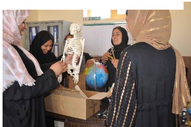
The teachers need additional teaching material for the 6th grade after a training course

new school building is being erected in the schoolyard. The boundary wall around the grounds is taking shape.