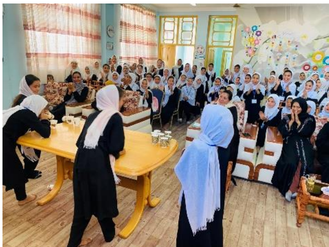
Events with lectures, games and singing are also organised

From time to time, however, there are small - minimal - improvements for the worst-affected girls and women: In Andkhoy: A temporarily appointed hardliner was transferred back at the insistence of the local government. In his opinion, all women in the village should have been accompanied by a "mahram", a male member of their family, when shopping in the bazaar. At least that could now be avoided. How else were women without a healthy husband or son supposed to feed themselves?